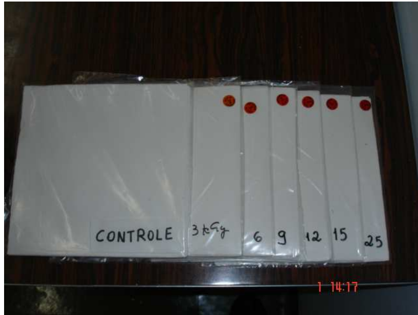
Figure 2. Laboratory eucalyptus sheet grouped after irradiation

The sheet samples were prepared as indicated in ISO 5269-1:2005 standard method and tested according to standard methods (Table 1). at the Pulp and Paper Laboratory of the Institute for Technological Research, São Paulo. The irradiation of the samples were done at Centro de Tecnologia das Radiações, Instituto de Pesquisas Energéticas e Nucleares.